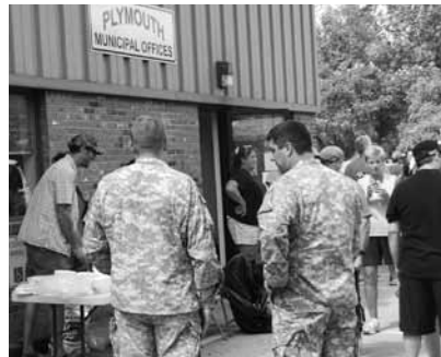
Retreat Crew serving food to National Guard and other volunteers in front of Plymouth Town Hall.

All told, this has been a difficult experience, but a powerful means of building community. We are receiving letters and Facebook postings almost daily. An example of some of these letters include: