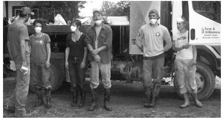
“F&W Disaster Corps” after a long day of shoveling mud.

We want to thank you and the capable, hard working, generous, warm and fun staff of F&W for your efforts during the hours and days immediately following Tropical Storm Irene. Given that we have two young children, we were particularly concerned with their well-being and extremely comforted to be surrounded by such wonderful people.