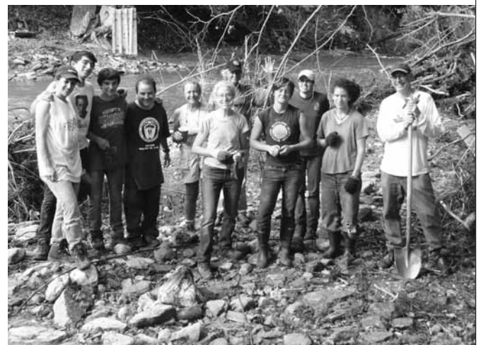
An F&W led community volunteer event cleaned up debris from local streams and brooks.

We are very appreciative to have felt all of the Farm & Wilderness community holding us in the Light, and their generosity and concern allowed us to care for many others in turn. Thank you!