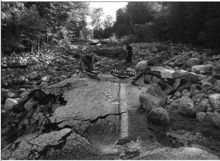
For days, the roads to F&W were impassable to all, except by foot and bicycle.