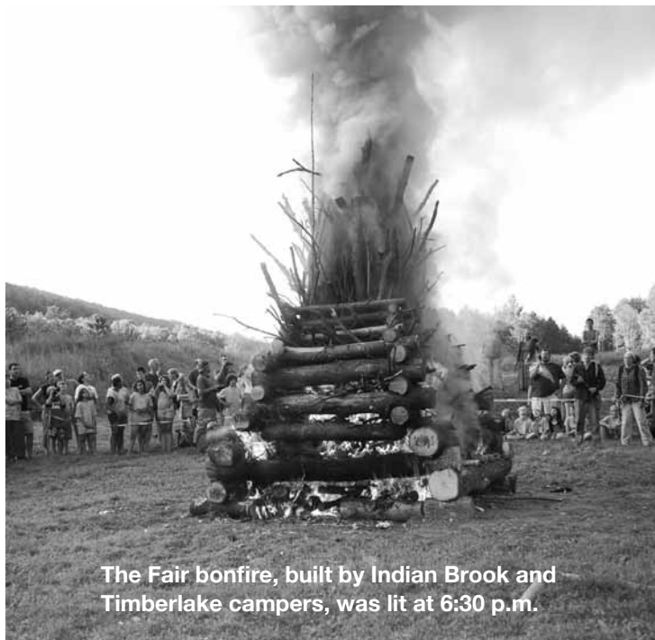
The Fair bonfire, built by Indian Brook and Timberlake campers, was lit at 6:30 p.m.

For the first time, Timberlake campers made and sold buckskin necklaces with pendants crafted from wood harvested from F&W forests. They also sold ceramic mugs made by the Timberlake arts director.